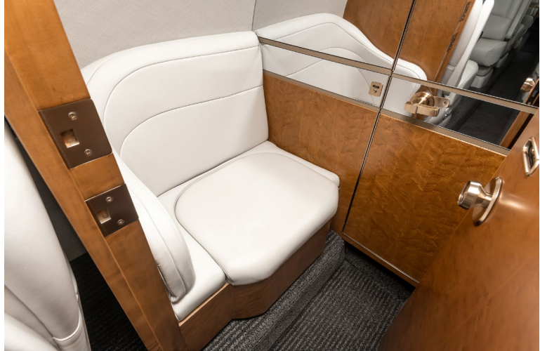
Specifications and/or descriptions are provided as introductory information only, and do not constitute representations or warranties of Pinnacle Aviation. Accordingly, you should rely on your own inspection of the aircraft. Subject to prior sale.