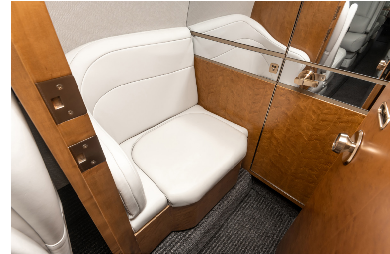
Specifications and/or descriptions are provided as introductory information only, and do not constitute representations or warranties of Pinnacle Aviation. Accordingly, you should rely on your own inspection of the aircraft. Subject to prior sale.