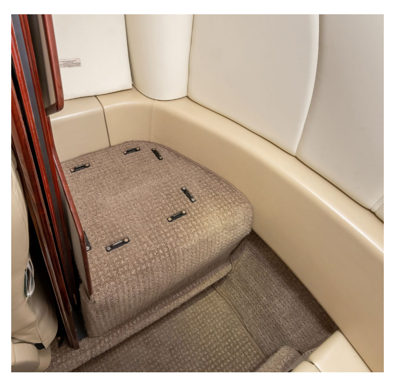
Specifications and/or descriptions are provided as introductory information only, and do not constitute representations or warranties of Pinnacle Aviation. Accordingly, you should rely on your own inspection of the aircraft. Subject to prior sale.